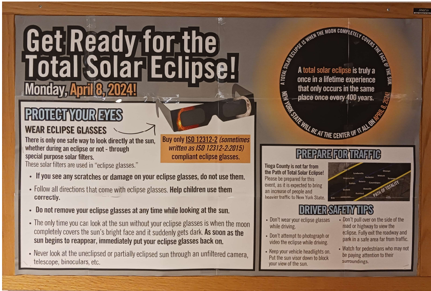
Bulletin Boards: HHS Building, April 2024