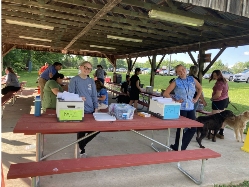
Hickories Park, Owego Rabies Clinic June 6, 2024