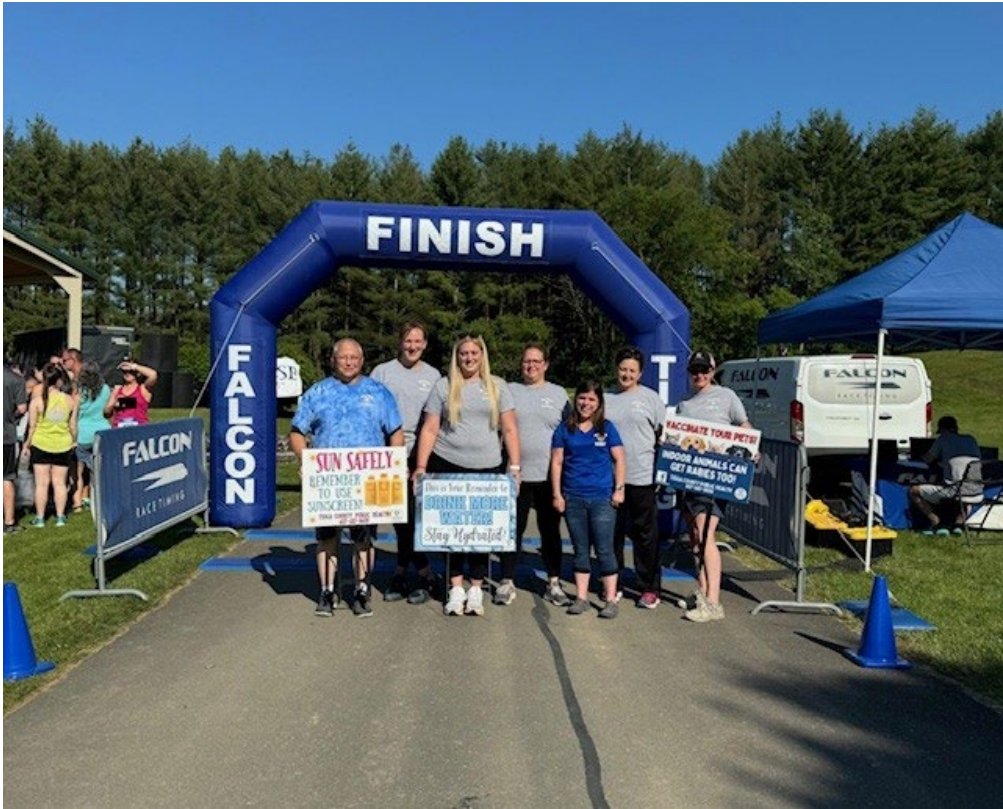
2024 Strawberry Fest 5K, June 13, 2024