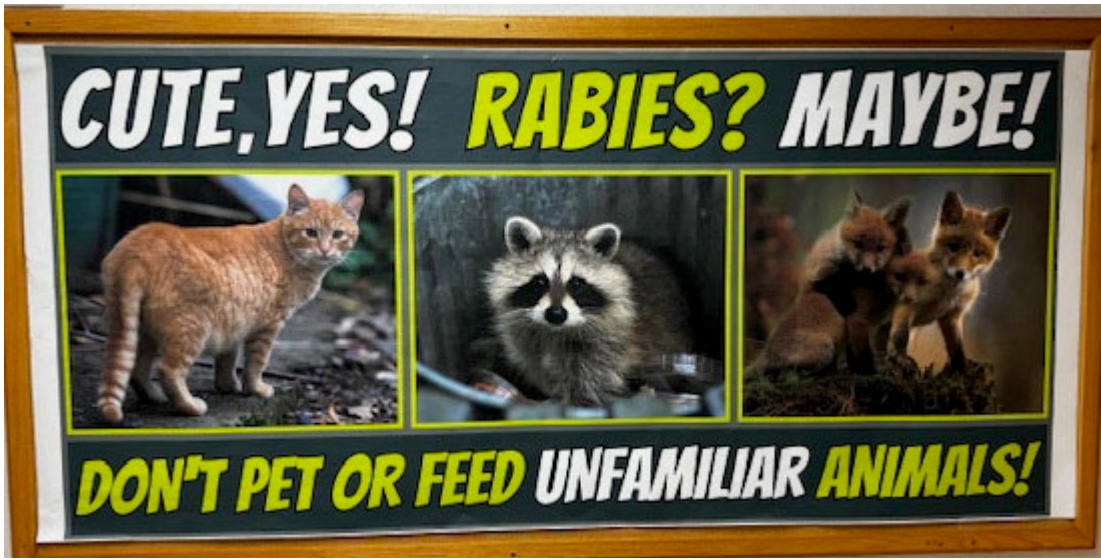
Large Bulletin Board: HHS Building, June 2024