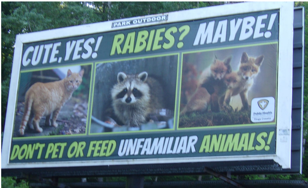
Billboards, Various Locations, June 2024