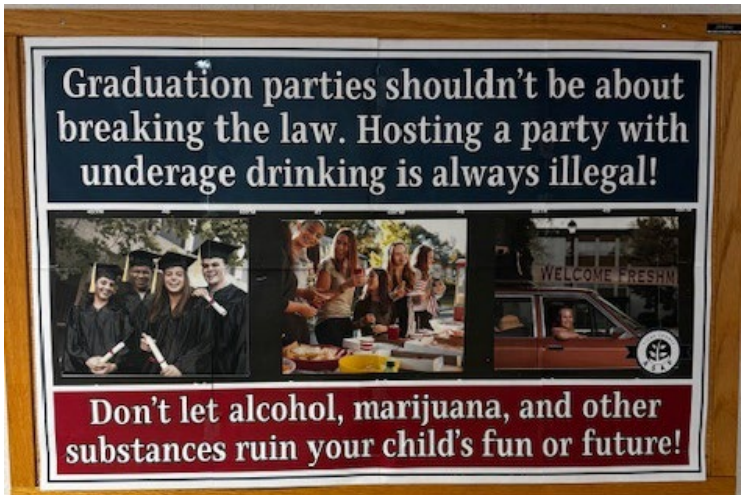
Small Bulletin Board, HHS Building, June 2024