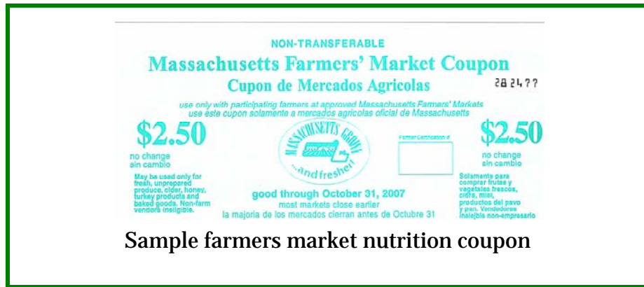
Sample farmers market nutrition coupon

Many farmers markets participate in a program called the Farmers Market Nutrition Program. This program gives low-income seniors and women with children coupons to use at farmers markets. These coupons are called Farmers Market Nutrition Coupons and Senior Farmers Market Nutrition Coupons.